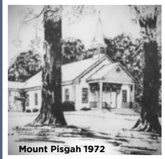
Mount Pisgah 1972